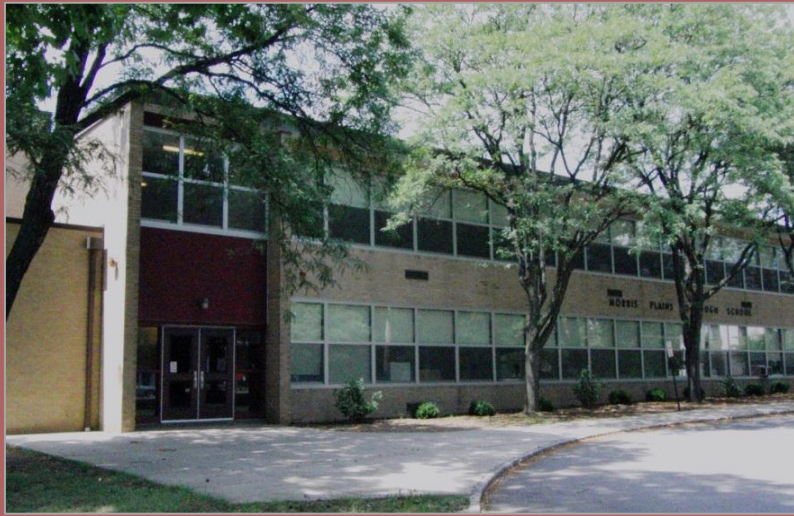
Morris Plains Borough School